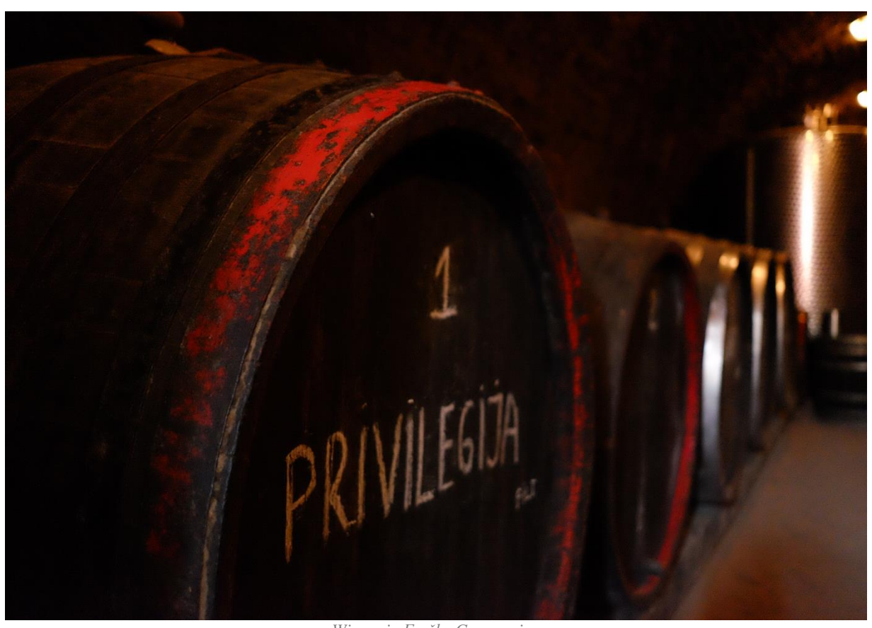
Winery in Fruška Gora region