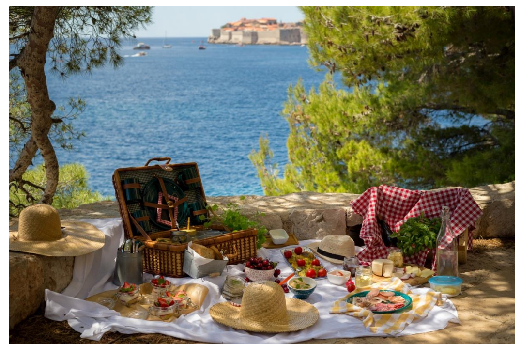
Dubrovnik Food Story

On our final day of the extension, we will eat breakfast as we say our goodbyes and prepare for transfers to the airport.