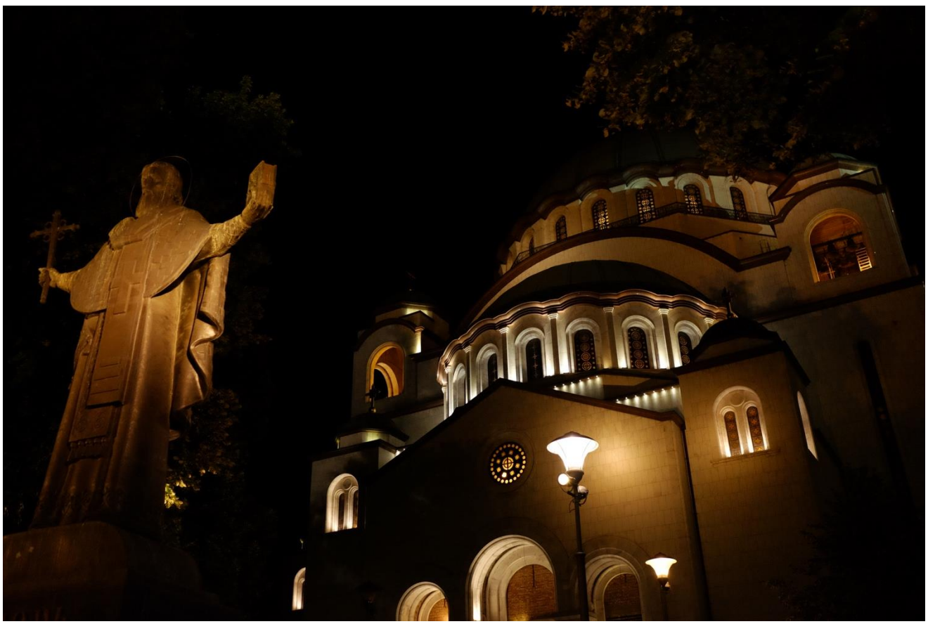
St. Sava Temple, Belgrade, Serbia

After dinner we have the opportunity to stroll the pedestrian promenade behind our hotel for drinks, coffee, or some live music at our leisure.