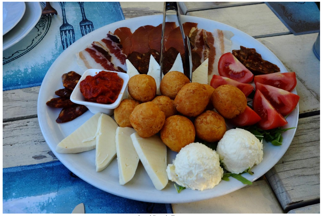
Local Sample Tapas