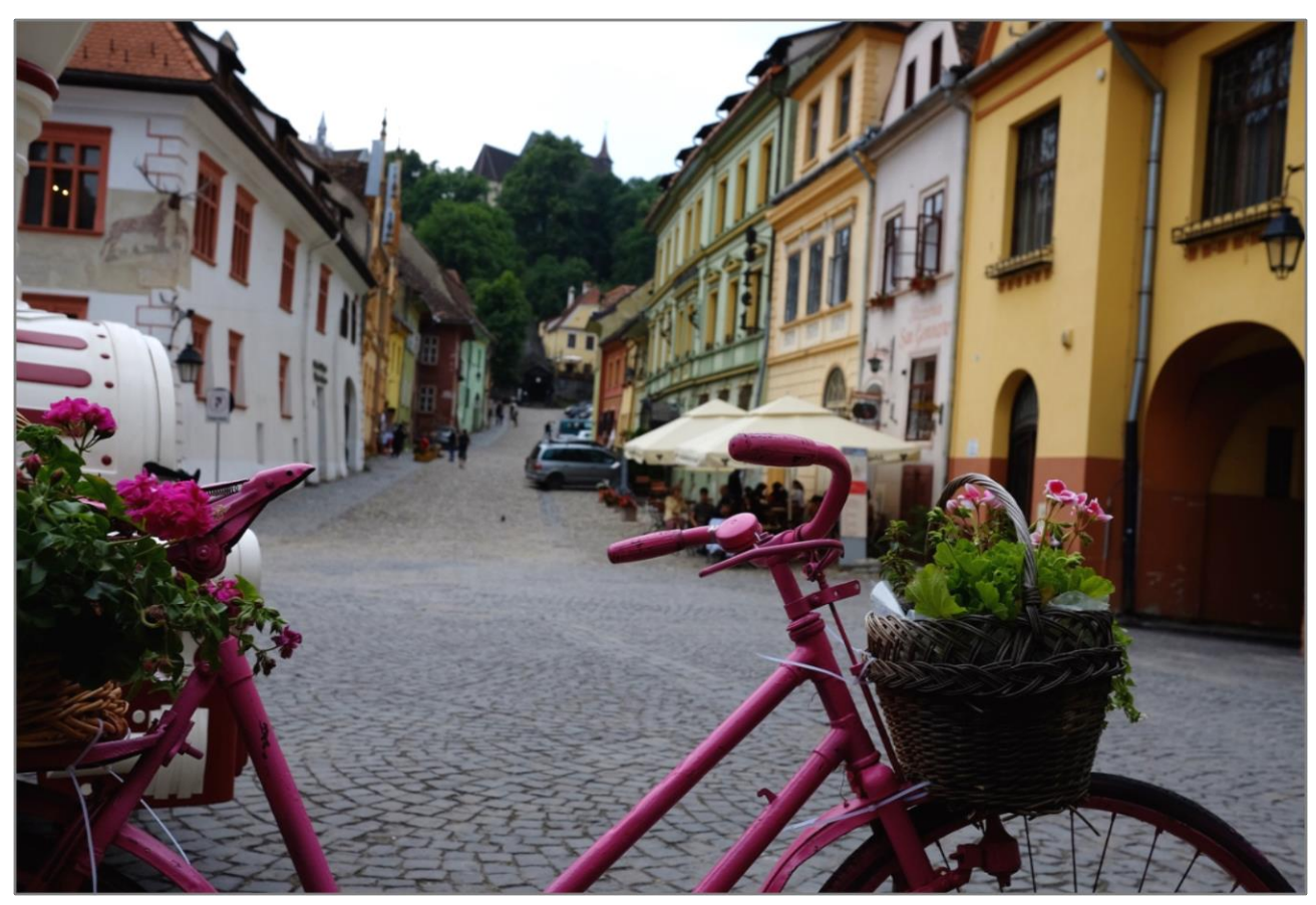
The picturesque streets of Sighișoara

The Balkans: A beautifully diverse and historically significant area for the last several millennia.