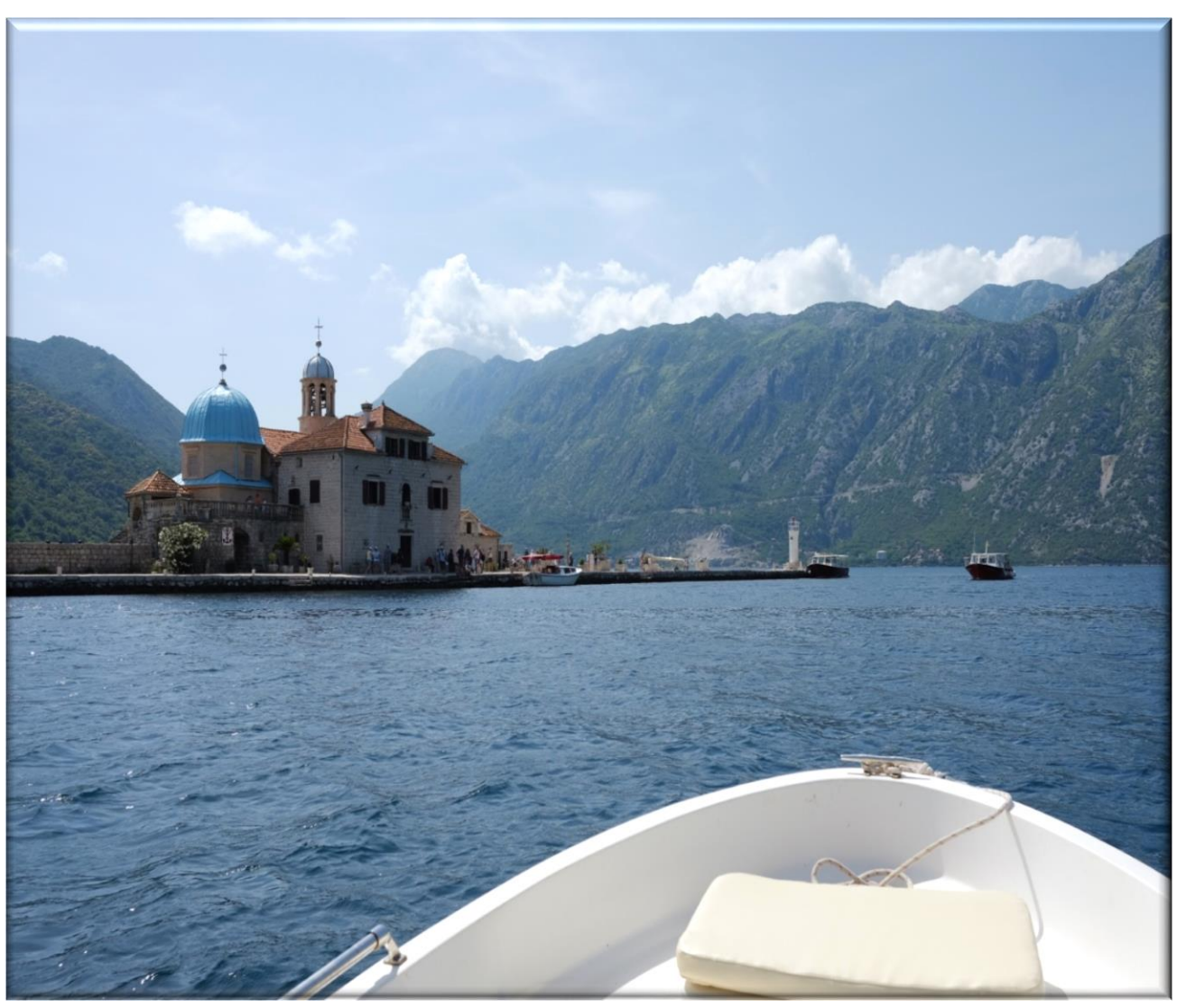
Our Lady of the Rocks - Kotor Bay