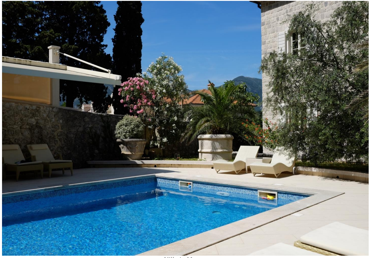
Villa in Montenegro